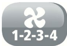
4 fan speed settings